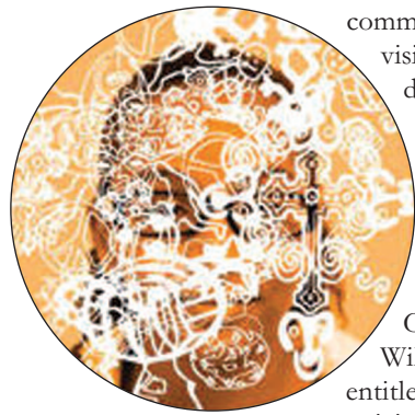
Exhibit open through January 3