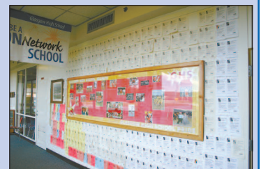
Glasgow High School proudly displayed their completed pledges.