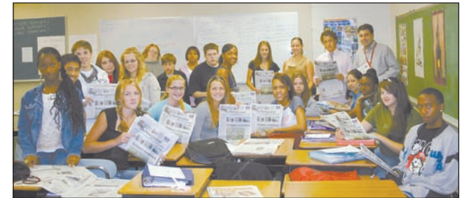
Journalism students at Glasgow High School will work with professional mentors from the Wilmington News Journal this year, and GHS is one of only 43 high schools in the country to be selected for this opportunity.

Journalism students at Glasgow High School will have the opportunity to work with professional mentors from the Wilmington News Journal this year, as part of a $3,000 grant awarded to GHS by the American Society of Newspaper Editors Foundation. Glasgow is one of only 43 schools in the country to receive this grant and participate in the partnership with a local newspaper. This is also the first time that the News-Journal has participated in the program.