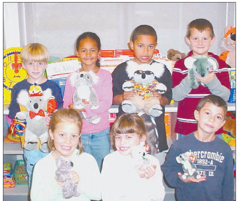
At left: Keene Elementary School has been recognized as a "Star School" for their Positive Behavior Support program for the past four years.

• Nine CSD schools have been selected as Positive Behavior Support "Star Schools." The District's nine Star Schools for 2005-2006 are Downes Elementary, Gallaher Elementary, Keene Elementary, Smith Elementary, Wilson Elementary, Stubbs Intermediate, Shue-Medill Middle, Delaware School for the Deaf, and Newark High School.