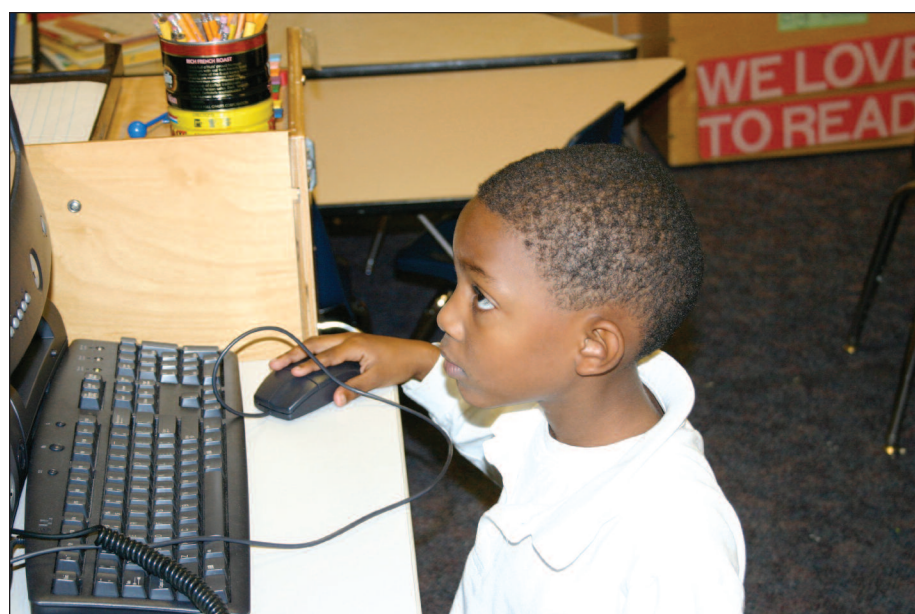
If the Referendum is successful, The District will double the amount currently spent on textbooks, technology, and other learning materials. Years of lean budgets have left schools underfunded and lacking resources.