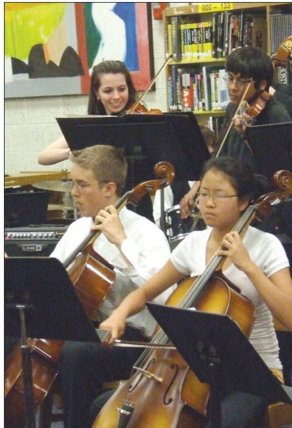
A successful Operating Referendum can help the district support art, music, physical education and library programs. Pictured here are members of the Newark High School Jazz Ensemble.